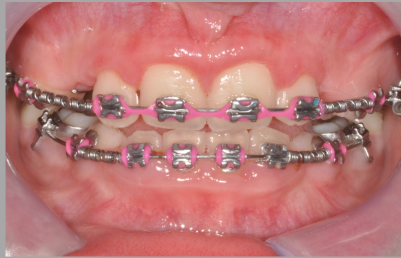
Thinner, healthier gum tissue