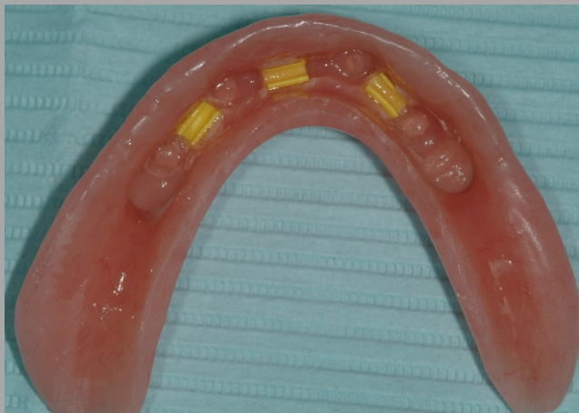
Underside of the Denture