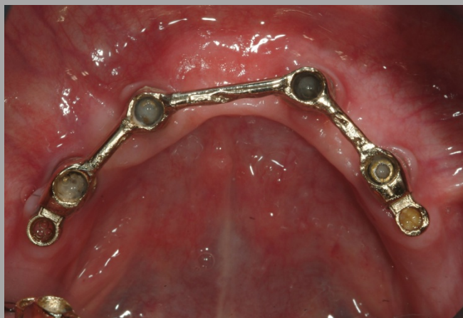
4 implants in Mandibular Arch